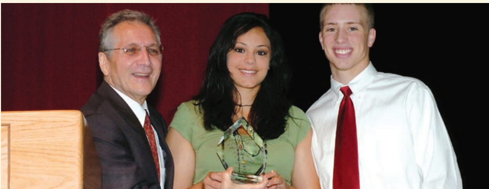
HOBBS HIGH SCHOOL, NM