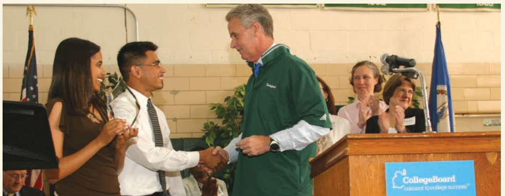
WAKEFIELD HIGH SCHOOL, VA

Celebrating America's Most Improved High Schools